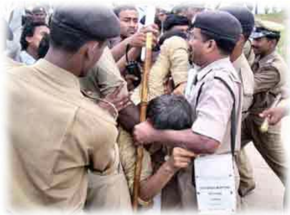
Tussle with Police when demonstration Infront of POSCO Office