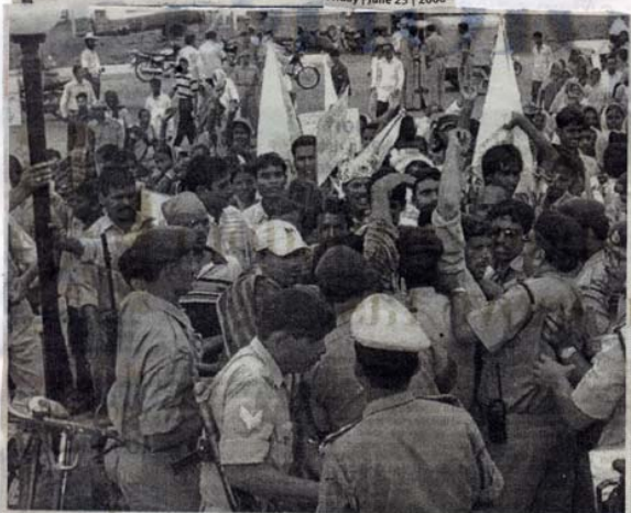
Members of Jibha Banchha Andolan, Rastriya Yuva Sangathan and Nava Nirman Samiti scuffle with the police in front of Fortune Towers in Bhubaneswar on Thursday during a protest rally against the Posco project in Orissa.