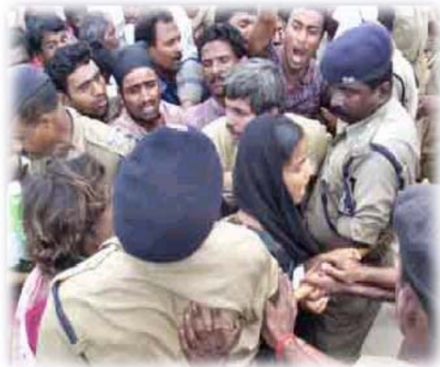
Demonstrators are shouting POSCO Go Back & Trying to Enter into POSCO Office, Police Obstructing them.